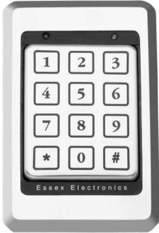
The KTP Series 12 Pad 3x4 w/ Stainless Steel Bezel

The KTP Series 12 Pad 3x4 is a virtually indestructible stainless steel Keypad reader designed to interface with most access control panels. Durable enough for even the most extreme outdoor environments yet attractively designed to suit all indoor applications.